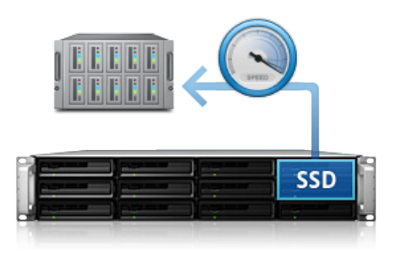
Figure 1) SSD Cache

Synology SSD cache technology boosts throughput efficiently while minimizing cost per gigabyte.