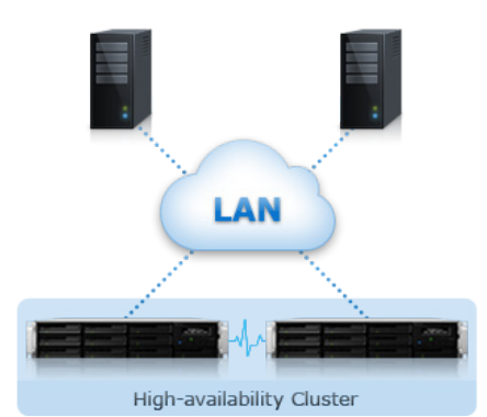
Figure 1) Reliability, Availability & Disaster Recovery

Synology High Availability ensures seamless transition between clustered servers in the event of server failure with minimal impact to businesses.